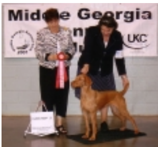
CH Vizland's Vizcaya Remy Red