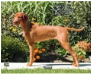
CH Vidor's Aura