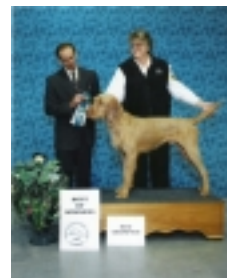
CH Quodian's Quasar, NA III, CGC, TDInc.