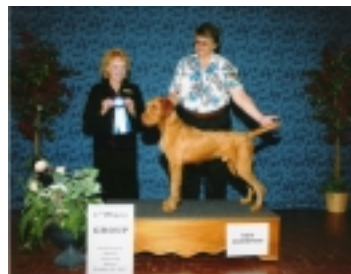
CH Thorn Hill's Hun, NA II